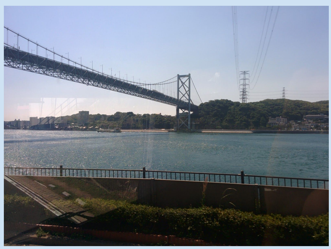
That's the main island just to the north of us.