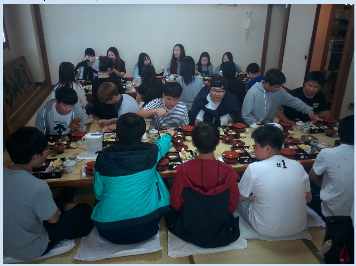
(Didn't we just have a huge breakfast? I know I did!)

Our next stop was for lunch, which consisted of delicious bento boxes.