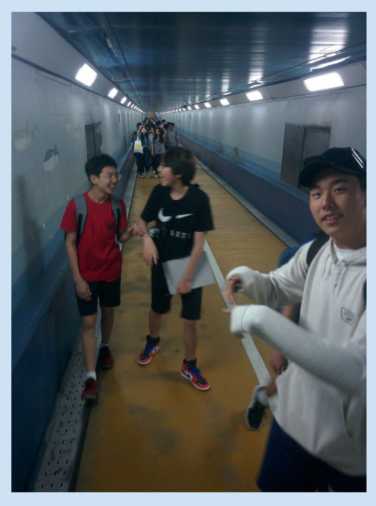
... WALK from one side to the other! (It's only 780 km.) And when you get to the other side, guess what? There's vending machines! (I think those are the student's favorite part of the trip).