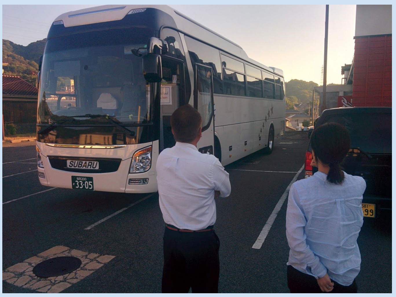
Our driver is on the left, and our tour guide, Kim Jinee, is on the right

and head home to our luxurious hotel where many students chose to spend an hour browsing the shopping area seen here from the window of one of our rooms.