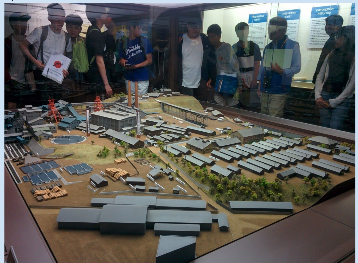
Students at the Tagawa Coal Museum examining a model of the mine when it was in operation.

After another sumptuous breakfast buffet we got a leisurely start to our day, departing on our bus at 9:30 a.m. on our way to our first stop, the Tagawa Coal Museum, about an hour south of here. The museum is located on the site of a former operating coal mine in the middle of a major coal-mining region from Japan's past. (We learned that Japan no longer mines any of its own coal but now imports it all for various uses such as generating electricity, making steel, and industrial chemical processes). During the approximately 100 year history of coal mining in this area it produced about half of all Japan's coal.