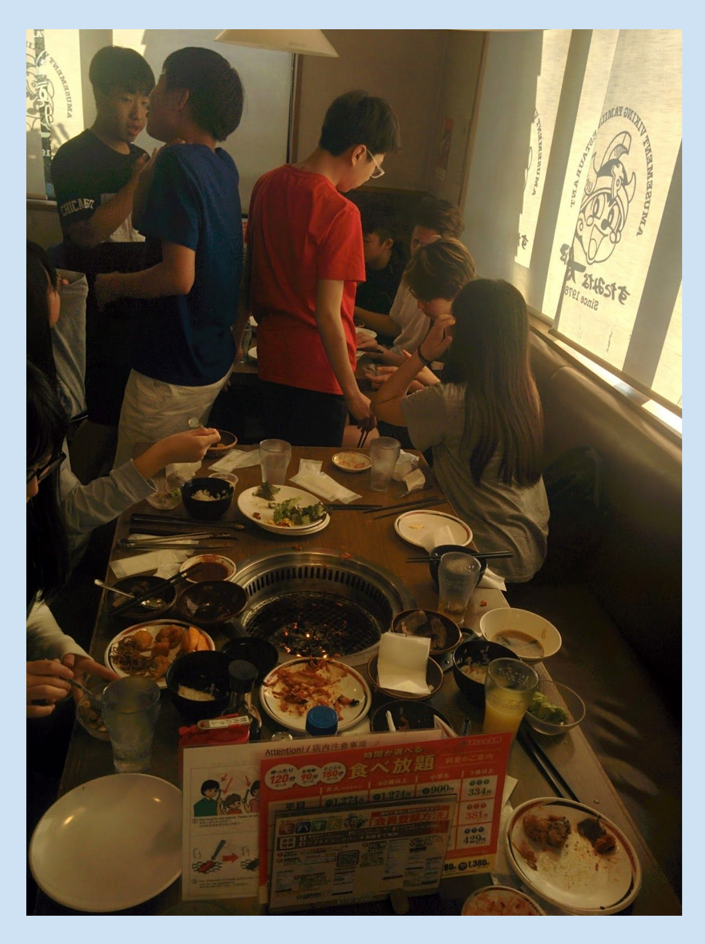
and, almost more exciting, cotton candy!