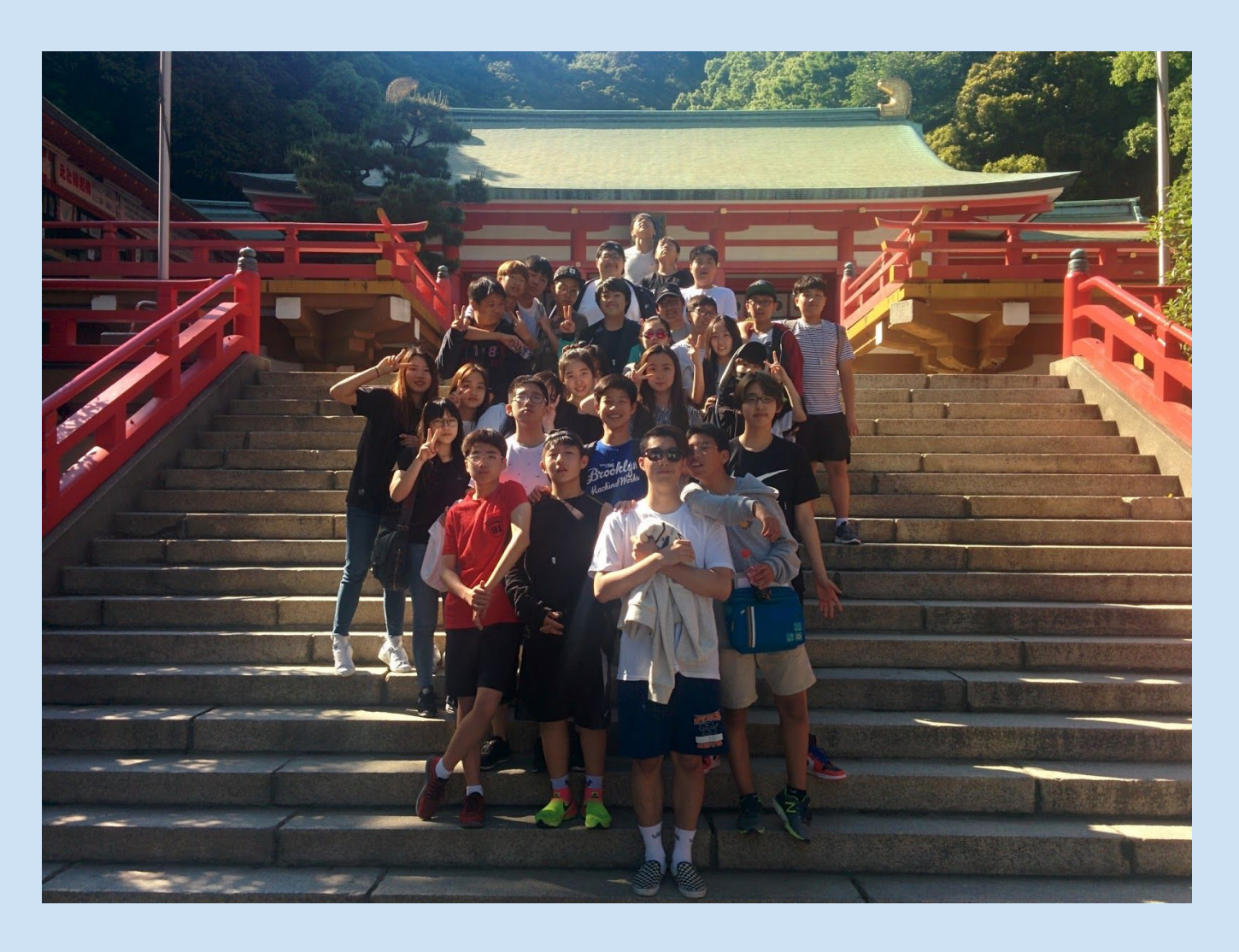
And then killed some time before dinner on the boardwalk playing "Ninja".