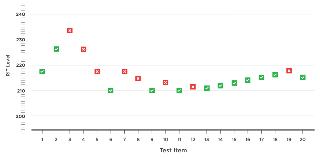
MAP Growth begins with a question at each student's grade level and adjusts the level of difficulty based on individual performance.

MAP Growth is a computer-adaptive test. If your child answers a question correctly, the next question is more challenging. If they answer incorrectly, the next one is easier. This type of assessment challenges top performers without overwhelming students whose skills are below grade level.