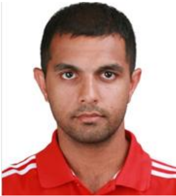
G5 P.E. Teacher